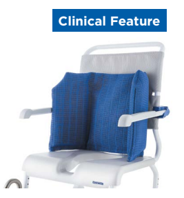
Soft backrest cushion

For additional stability and positioning. Will benefit small individuals and young adults.